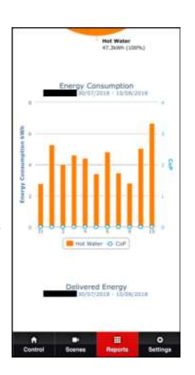
Fig. 1: Portal screenshot, 'Energy Consumption/ Delivered Energy'

In the following sections, we provide guidance on how to do this, whether you have a tablet, android phone, iPhone or PC.